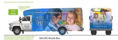
25-Ft Bus Maximum Available: Seven (7)

Acceptance of Applications is subject to availability of space and approval of the ad and its content.