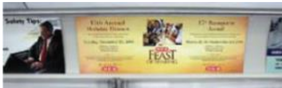
28"W x 11"H Interior bus ad space