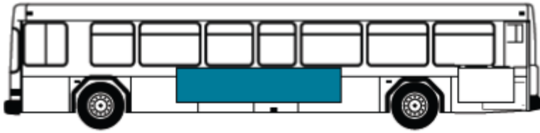
96"W x 27.5"H Exterior bus ad space Maximum Available: Fifteen (15)