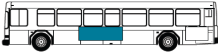
48"W x 17"H Exterior bus ad space Maximum Available: Thirty-four (34)