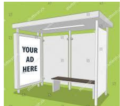
or 46"W x 67"H (Back-Lit) Maximum Available: Two (2) Located at JWO Transit Center