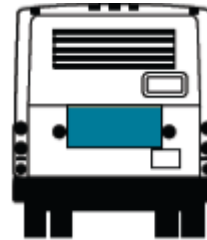
48"W x 17"H Rear exterior ad space Maximum Available: Eight (8)